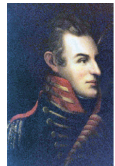
Zebulon Montgomery Pike from a mural at Flower Memorial Library, Watertown, NY.

So far nothing from Pike himself has emerged that justifies arming one-third of his regiment with an ineffective and obsolete weapon. So long as the enemy remained some distance away from the pike-armed men those weapons were totally useless. Presumably they would then drop their pikes and fire their muskets. Accuracy and range, however, was not great even with the regular musket and would be worse with the short barreled version. Pikes would be useful in repelling a cavalry attack, but cavalry (as opposed to dragoons or mounted infantry) was never used in combat by either side during the War of 1812.