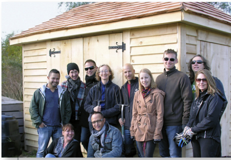
Some of the Fort York Gardeners who tend the 38 raised beds on the fort's north ramparts stand in front of their new tool shed, built with the aid of a grant from Walmart-Evergreen to look like one of the many 'necessaries' that once dotted the site. It will be whitewashed in the Spring.