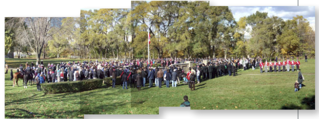
The largest crowd in years, estimated at 650-700 people, attended the Remembrance Day service for 2011 at Fort York's Strachan Avenue Military cemetery.