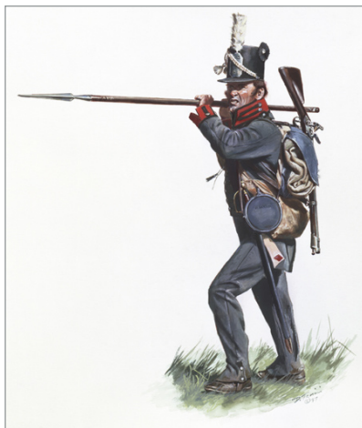
An American Fifteenth Infantry Regiment pikeman. The pikes were at least a meter (three feet) longer than shown here. Note the short barreled musket and the sword.

Derived from a simple spear, pikes had been in use for thousands of years, falling in and out of favour as the importance of cavalry on the battlefield waxed and waned. Alexander the Great's Macedonian phalanx had each man armed with a six metre (20 foot) long pike called a sarissa. Pikes continued in use well into the 1600s both as an offensive weapon—masses of pike-armed infantry would “push” up against each other hoping the enemy would give way first—and as a defence against cavalry. A cavalryman may want to run into and over a mass of pike-armed infantry but his horse was smarter.