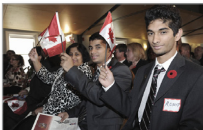
Candidates for Canadian citizenship take their oaths of allegiance at a ceremony on November 10, one of two held at Fort York annually.